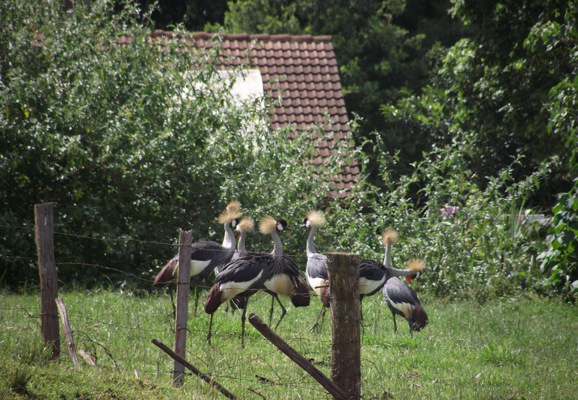
Promoting human-crane co-existence – the long-term goal