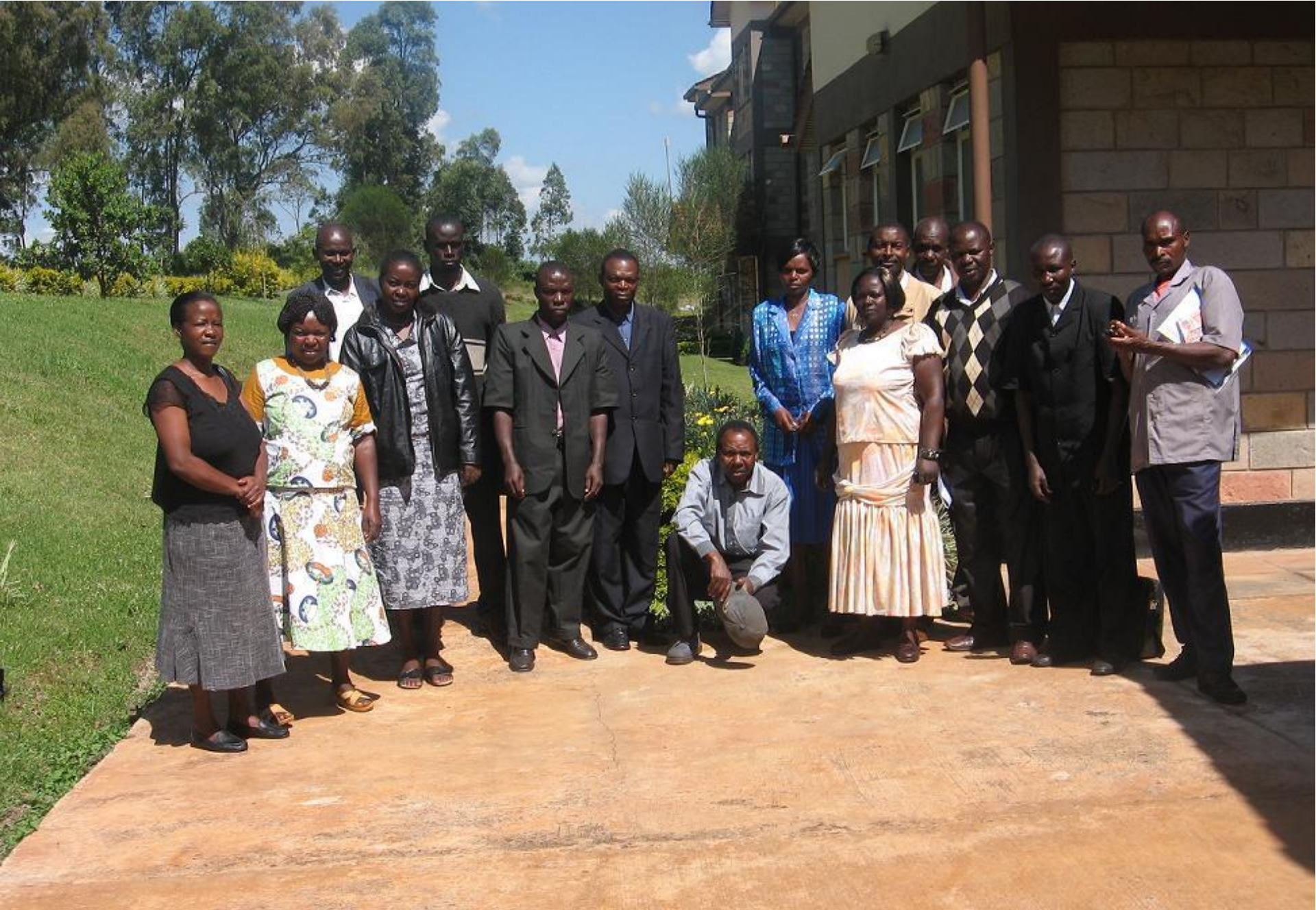
Building social networks - representatives from different sites