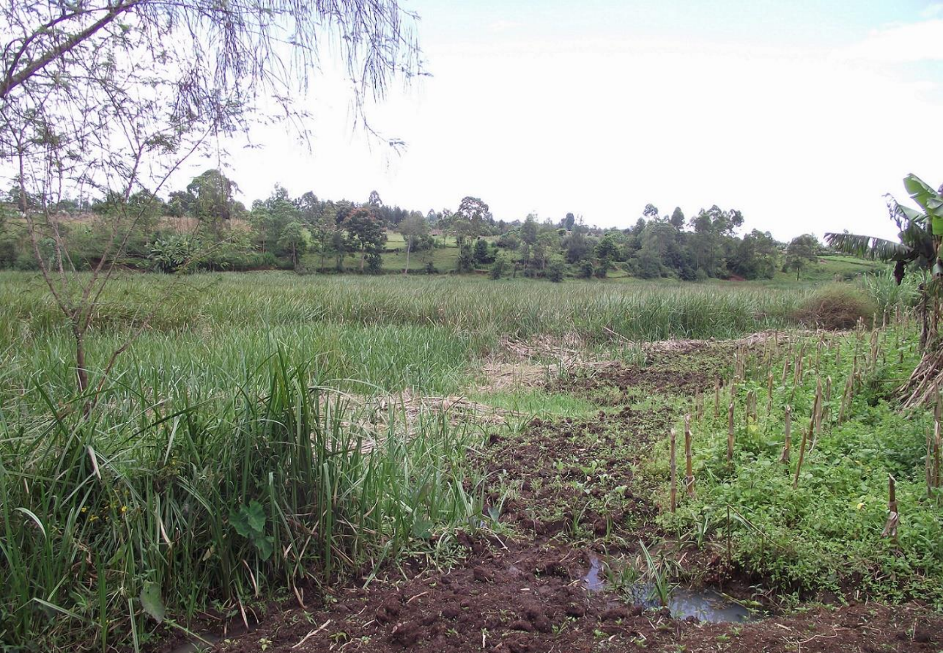
Wetland encroachment – the challenge being addressed