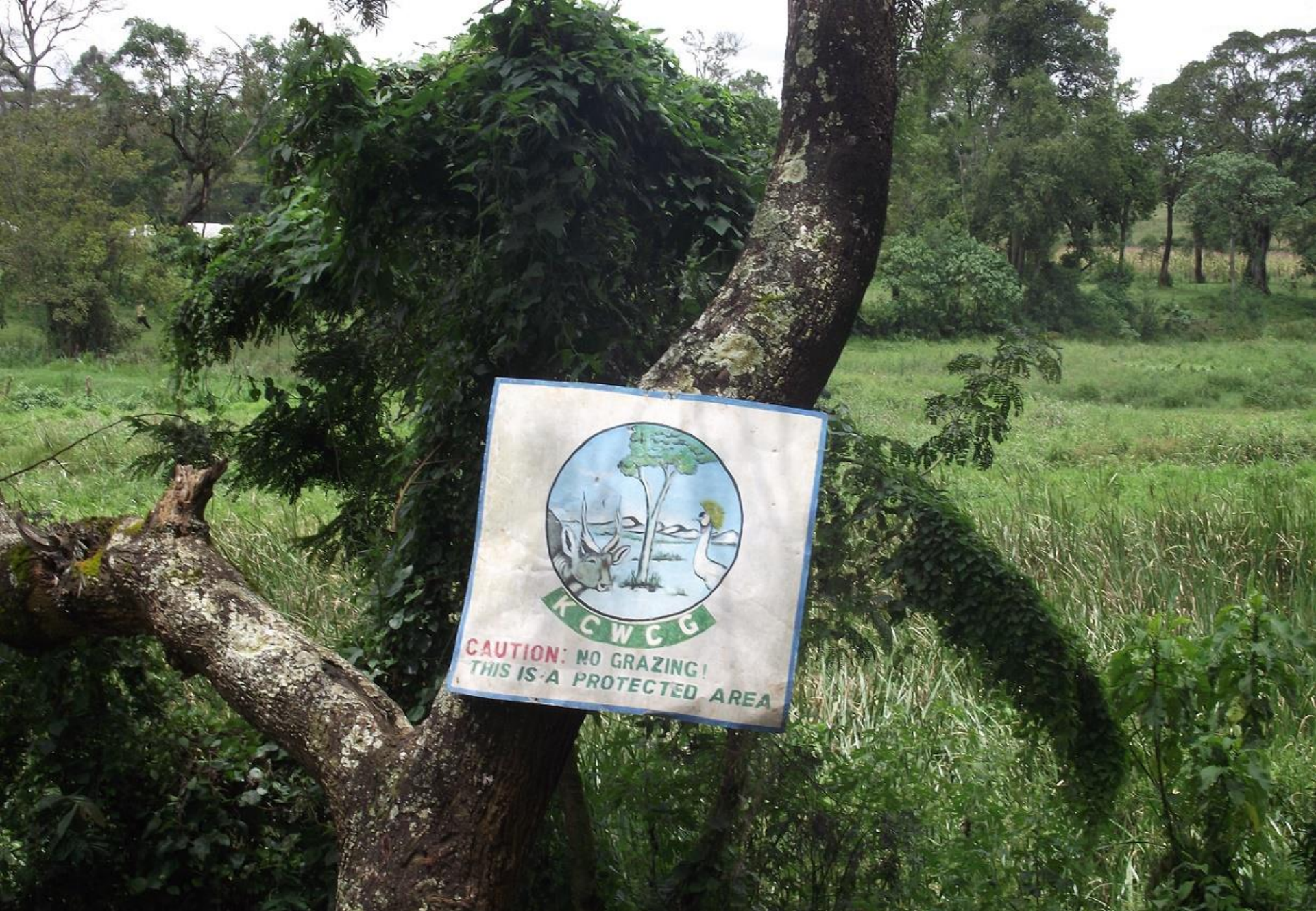
Community-agreed regulations for wetland protection