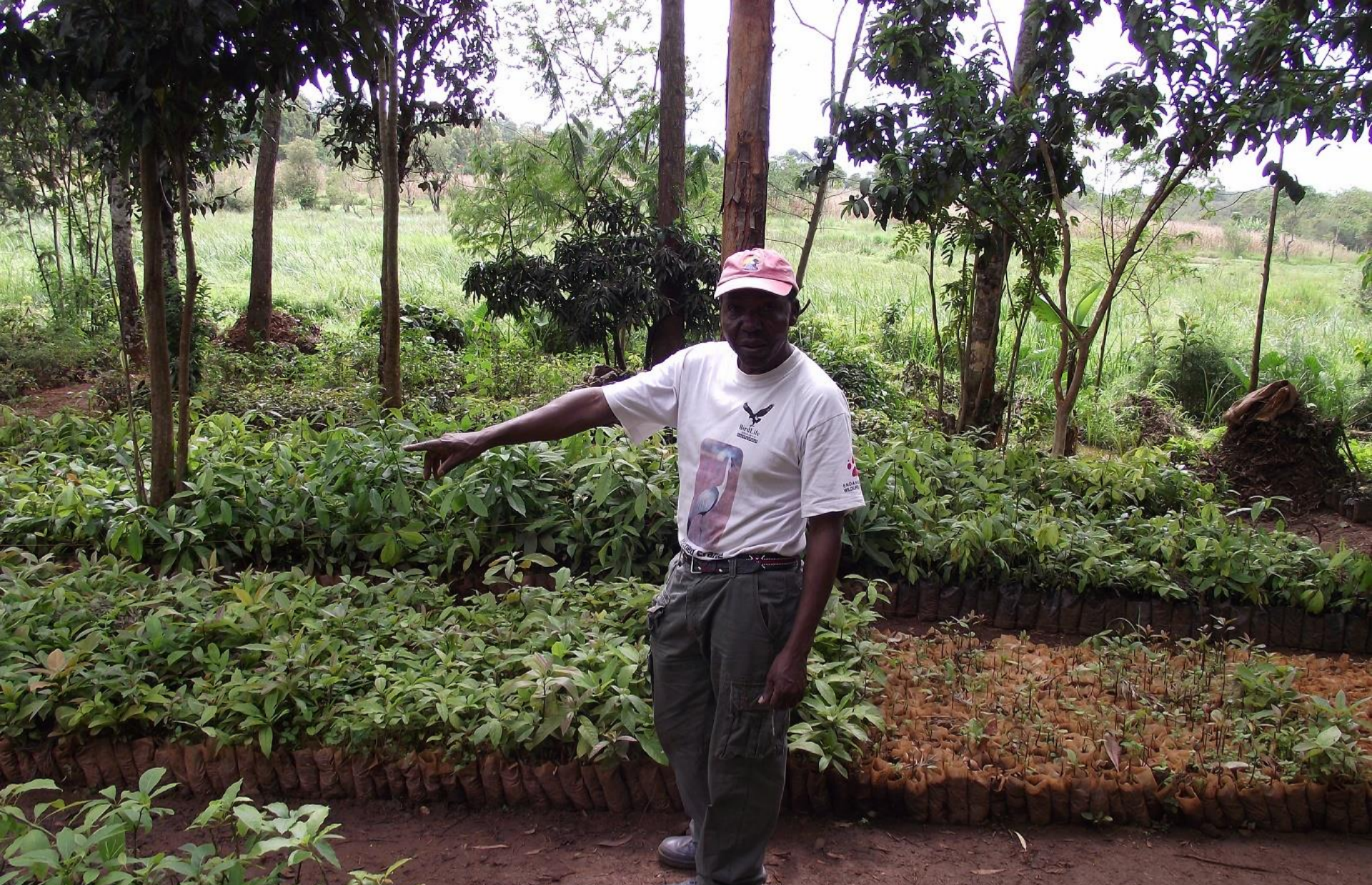
Tree seedlings – potentials for obtaining food security and wetland ecosystem restoration