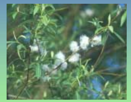
Fig.1: Fructifying Salix purpurea.