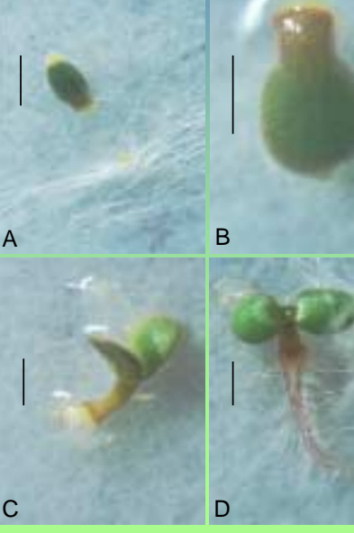
Fig. 2: Germination of Salix fragilis . Scale = 1 mm. A: Seed, B: swollen seed after 5 hours on moist filter paper, C: 1-dayold seedling, testa stripped off, hairs at the base of hypocotyl visible, D: 3-days-old seedling, radicle with hairs, horizontal arrangement of cotyledones.

Fig. 4: Spatial distribution of seedlings on two sample areas at the first recording date in June 2000 for early and late seed dispersers. X-axis at y = 0 complies to the waterline at mean summer water level. Open circles: cluster index < 0, filled circles: cluster index > 0. Big open circles belong to a gap of seedlings (cluster index < -1,5), big filled circles belong to a patch of seedlings (cluster index > 1,5). The triangle markes the spatial mean of seedling distribution.