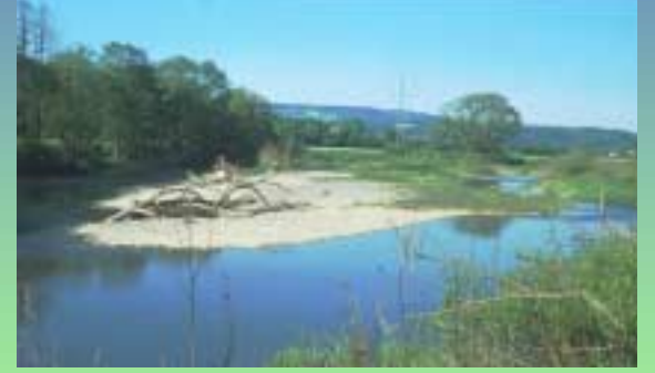
Fig. 3: Study site Marktzeuln at the river Rodach (Germany, Bavaria, Upper Franconia). Sample areas I and II were located on this river bank.

Fig. 5: Distribution of seedlings of early and late dispersers (differentiated into first and last recording date 2000 and sample areas I and II) according to the relief. Number of individuals are combined to relief categories of 3 cm. Water levels during the time of seed dispersal for both species groups are shown as box plots (Median, 10^{th}, 25^{th}, 75^{th} and 90^{th} percentiles shown as boxes with error bars).